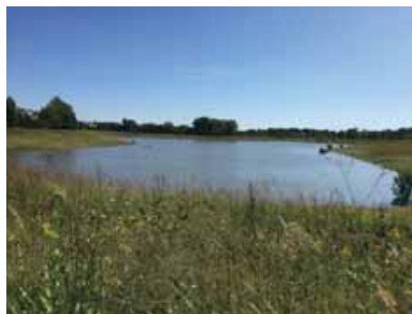
A view of the Techny Basin after a few days of rain (left) from the bike path (right).

The Illinois Bicycle Path Grant Program was created in 1990 to financially assist eligible units of government acquire, construct, and rehabilitate public, non-motorized bicycle paths and directly related support facilities. Grants are available to any local government