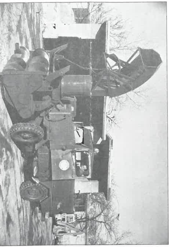
North Kalas, Glenview Public Works maintenance and equipment operator, runs the village snowblower, which picks up piles of plowed snow in the business district and deposits them in trucks for hauling to vacant land or the river. The snowblower was acquired about 5 years ago.