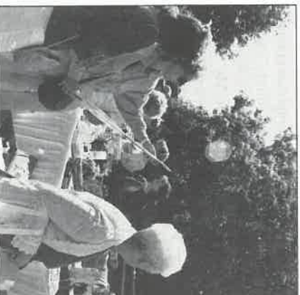
Scenes from the 1987

Contest rules are announced in December/January issues of the Glenview Newsletter .