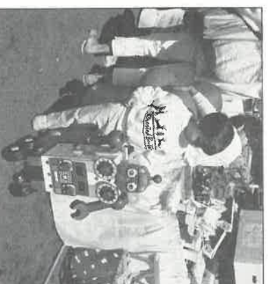
Bear Fair street sale