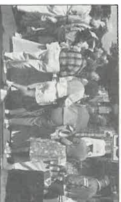
Mini Chan photos

On stage: "Mr. D's Magic Show" (9:30-11am, sleight-of-hand and illusions), "Sundance" (11am-2pm, upbeat tunes), and "Firing Line" (2:30-5pm, more music). Please see parking bans for June 25 and the July 4 fireworks — page 3.