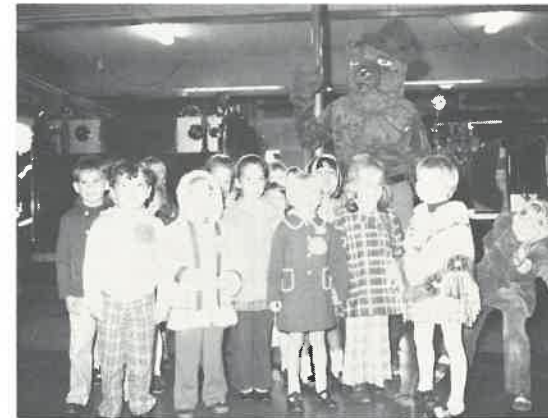
Glenview Firemen giving previews of Fire Prevention Week Activities.